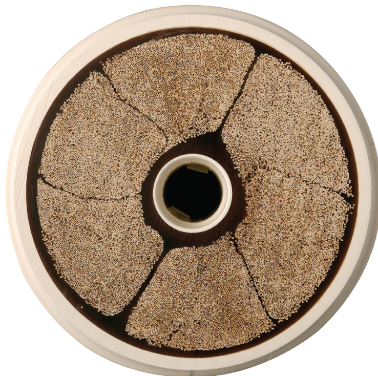
Hollow Fibre Membrane Element

Eta's team of experienced engineers offers a wide range of services and will assist with process evaluation and optimisation for new applications.