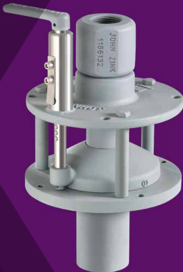
Above: Three-bolt configuration (shown as mounted)