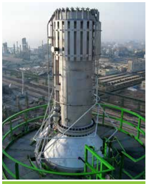
360° ACCESS PLATFORM