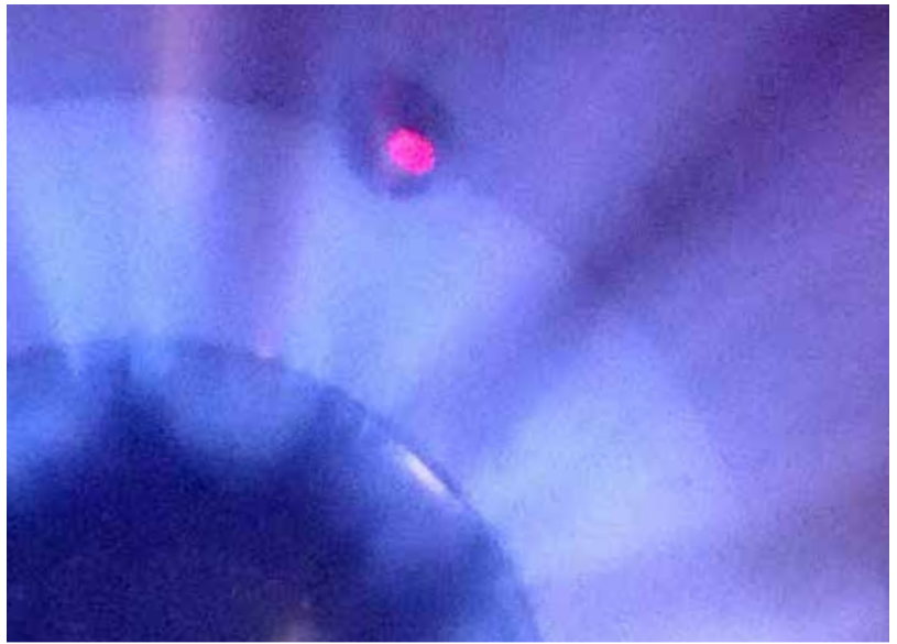
FRONT VIEW - INSENSUS IN OPERATION