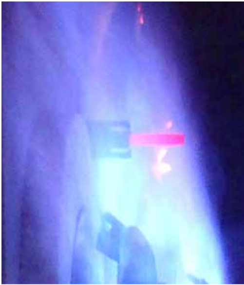
SIDE VIEW - INSENSUS IN OPERATION

The InSensus ignition and flame detection system provides dependable remote ignition, ensuring successful light-off without the need for complicated setup or tuning. Made with durable materials, it extends the service life of the system even in harsh environments. In addition, its compact, single-rod design makes it ideal for retrofits and confined spaces.